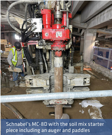
Schnabel's MC-8D with the soil mix starter piece including an auger and paddles

The project had a very tight deadline, as the renovations needed to be completed before the 2025 MLB season. To ensure that the project stayed on schedule, Schnabel's team worked overtime, including double shifts and Saturdays. The company's commitment to maintaining a fast-paced schedule allowed the project to remain on track despite the challenging timeline.