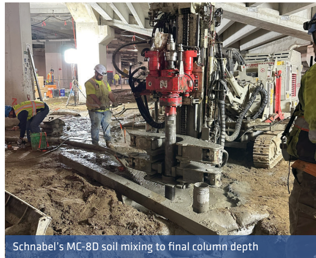
Schnabel's MC-8D soil mixing to final column depth