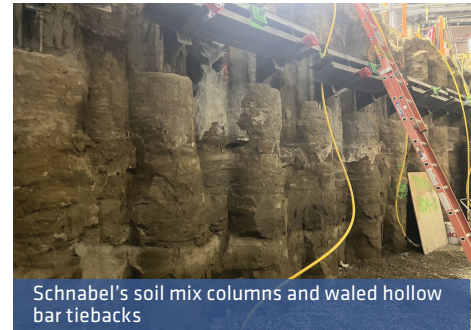
Schnabel's soil mix columns and waled hollow bar tiebacks

Schnabel successfully completed the installation of the temporary ERS and micropiles two weeks ahead of schedule . This early completion provided the client with a valuable buffer in their timeline, which helped ensure that the overall renovation project stayed on course for the re-opening of Progressive Field before the start of the 2025 MLB season. The work performed by Schnabel facilitated the first player-centric improvement in the stadium's history to be completed on time, setting the stage for the next phase of renovations at Progressive Field.